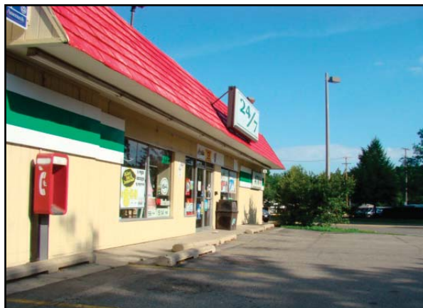
Photos: Business storefronts along Michigan Avenue