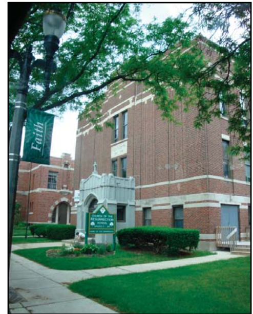
Top Left: 2000 Block of Michigan Ave Bottom Left: View of Clemens and Michigan Ave Intersection Bottom Right: Local business Top Right: Church of the Resurrection School